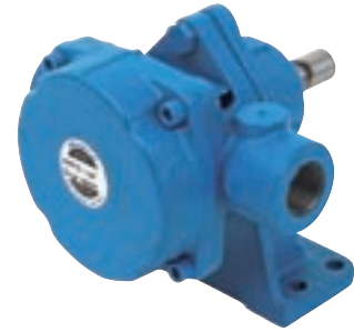
Model Number: 0507C-DP